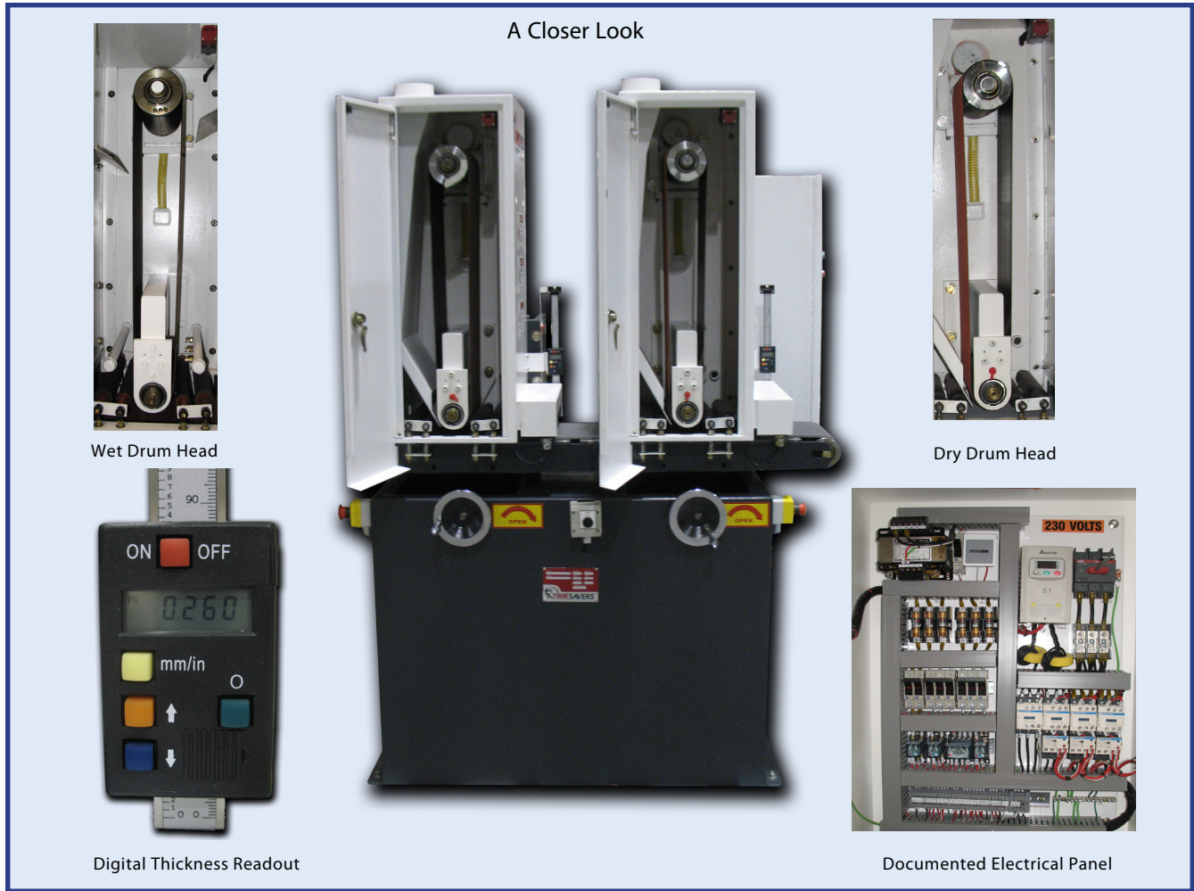
A Closer Look