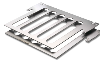
Finishing Before & After

The Removal of Burrs on Laser, Plasma or Water Jet, Punched, Cut Parts, Machined & Router Parts • Stainless-Steel, Steel, Copper, Aluminum, etc. • Deburring of Zintec, Galvanized and Plated Material, Aluzinc, Alclad, incl. Ink-Marked Parts • Uniform and Controllable Side Radius for Industries, Such As, Aerospace, Catering, and Medical • Use of Cobots Integration in an Industry 4.0/Smart Industry Software Platform