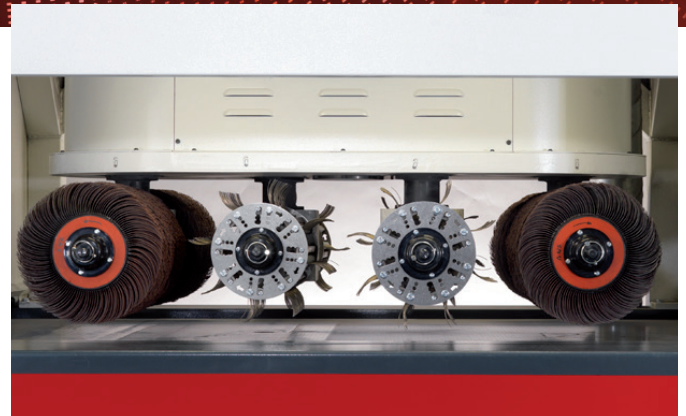
Special Laser Oxide Brushes for Oxide Skin Removal