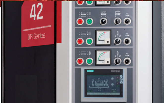
Ergonomic Control Panel with Siemens HMI