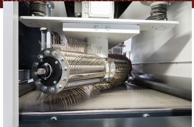
Special Laser Oxide Brushes for Oxide Skin Removal