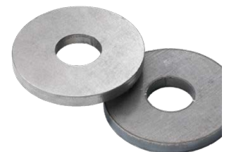
Oxide Skin Removal Sample