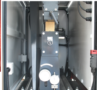
Digital Thickness Display